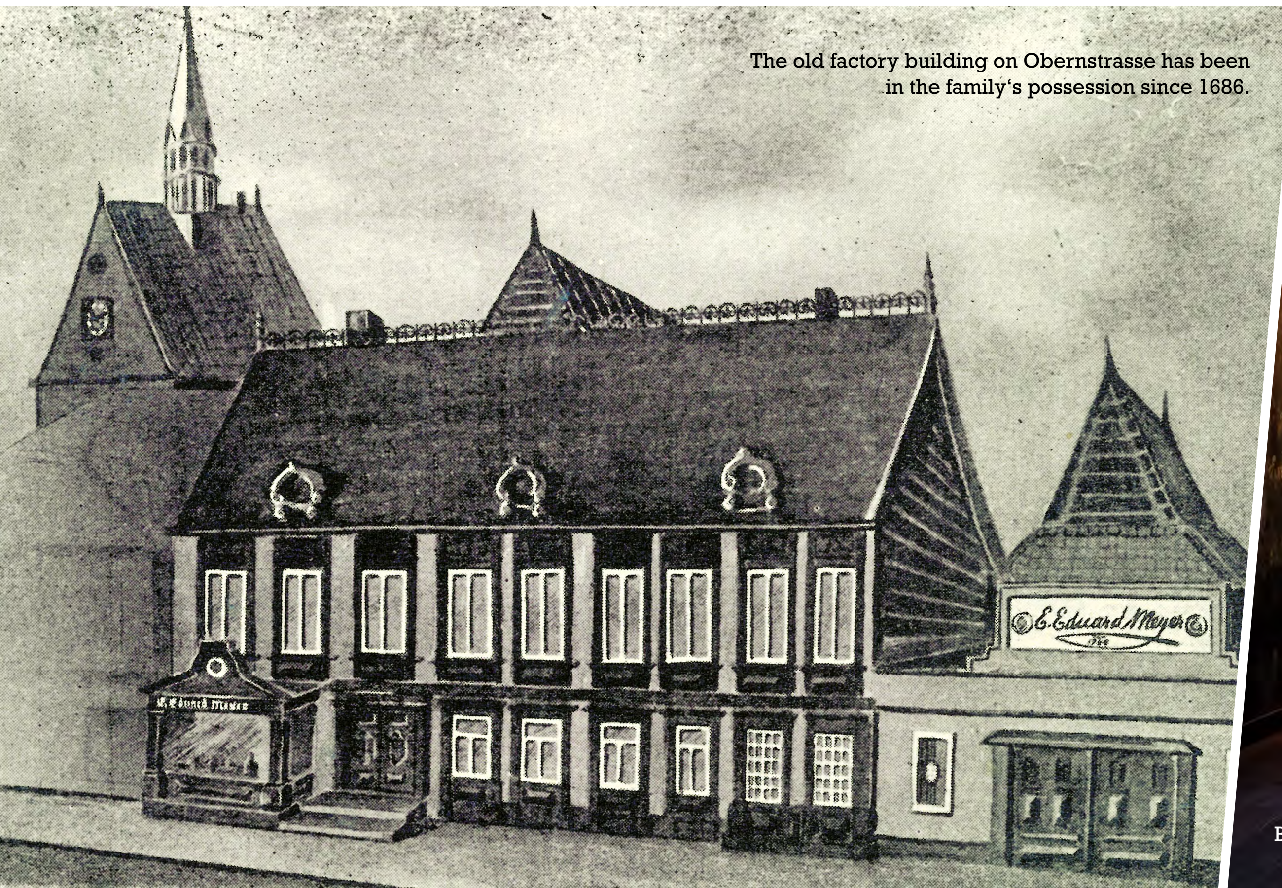
The old factory building on Obernstrasse has been in the family's possession since 1686.